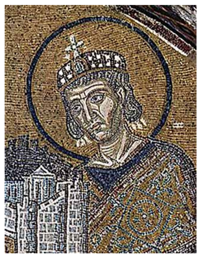
Mosaic in the Hagia Sophia, Constantinople, donor portrait of Emperor Constantine I with a model of the city

Constantine was an idealized archetype of the Christian ruler, a symbol of the emperor's legitimacy and identity and a model for comparison. Therefore, Byzantine emperor was considered heir of Constantine and the defender of the faith - he was considered "as new Constantine". This Byzantine political ideology was also adopted in medieval Serbia. In the 13th and the 14th century, this ideology was almost simultaneously developed in painting and literature. In the