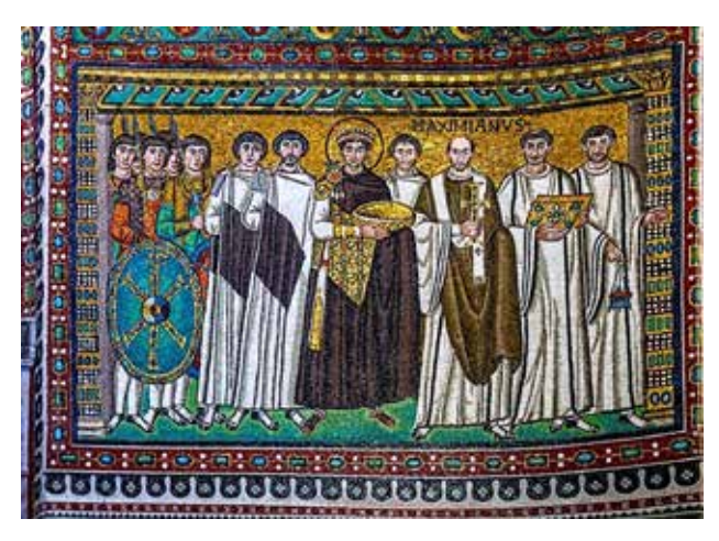
The 6th-century mosaic panels of the Emperor Justinian I and Empress Theodora show each of the imperial couple standing confidently with a group of attendants, looking out at the viewer.

church were often accompanied by a bequest or condition that masses for the donor be said, and their portraits were thought to encourage prayers on their behalf. Displaying portraits in a public place was also an expression of social status. Their additional purpose may have been to serve as role models for the praying believer, as a mirror for the recipient to reflect on himself and his sinful status.