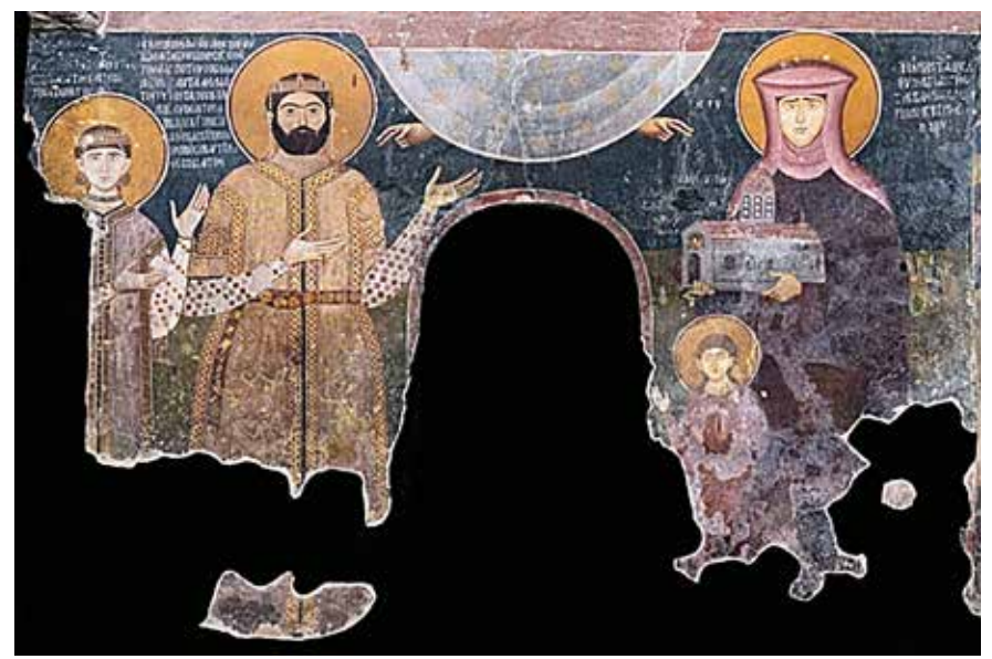
The donor's composition at St. George, Pološko

assimilated with St. Constantine the Great and Archangel Michael in St. George at Pološko.